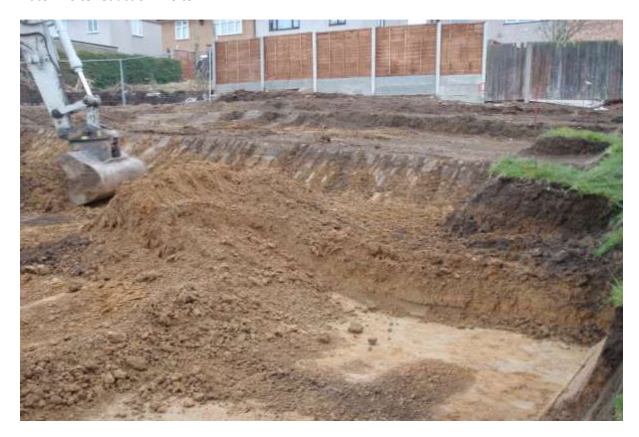
Plate 3. Site reduction in Site A