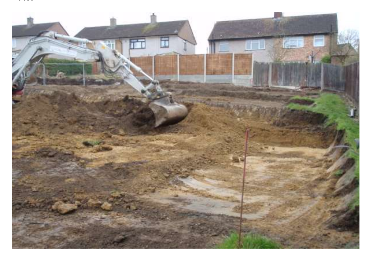
Plate 2. Site reduction in Site A