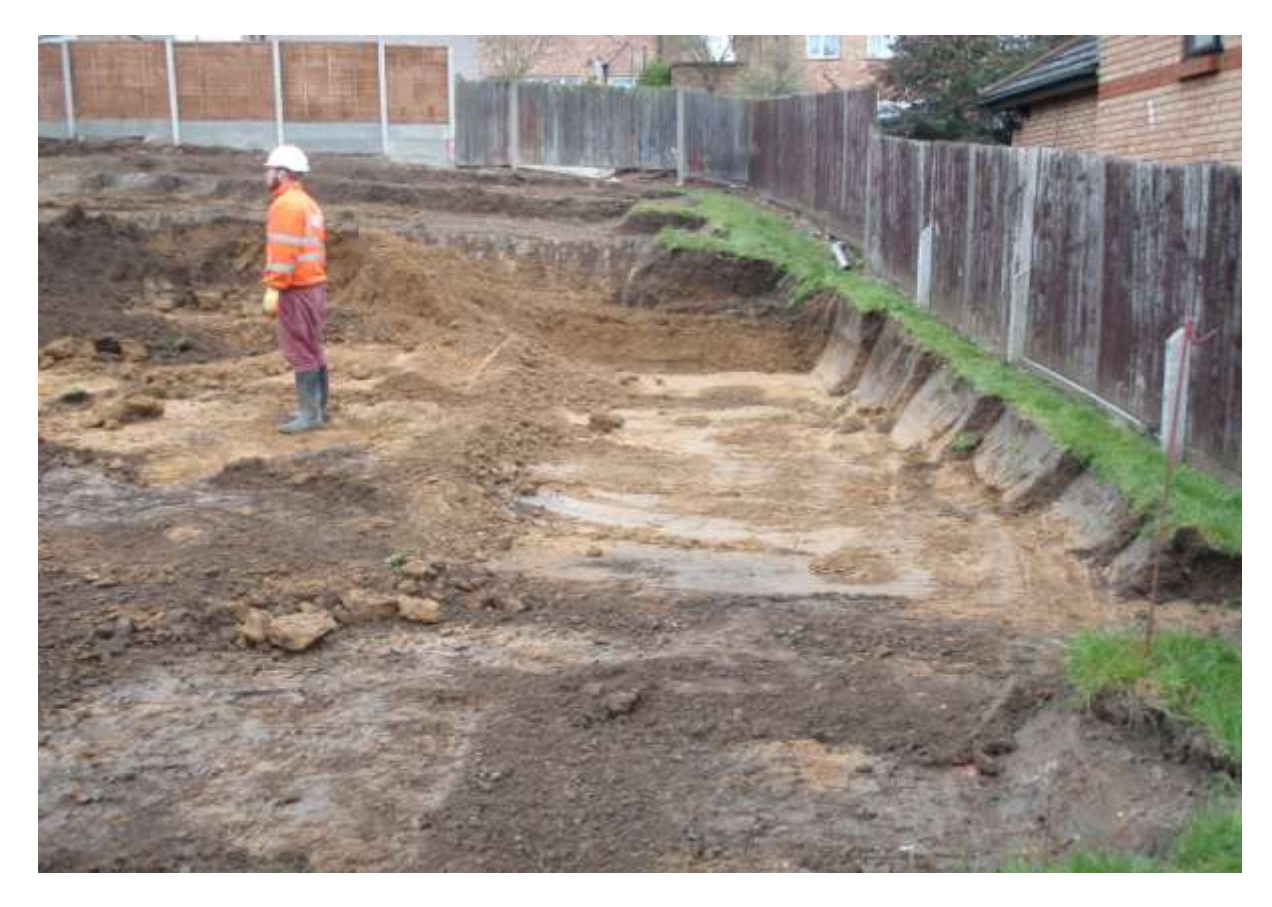
Plate 5. Site reduction in Site B