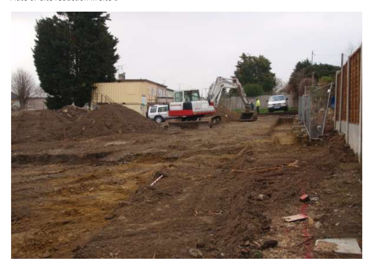
Plate 7. Site reduction in Site B