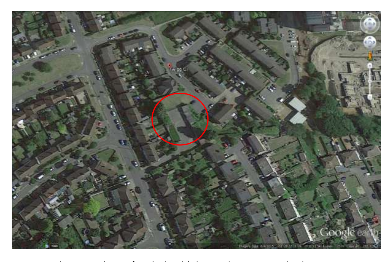
Plate 1. Aerial view of site (red circle) showing the site prior to development.