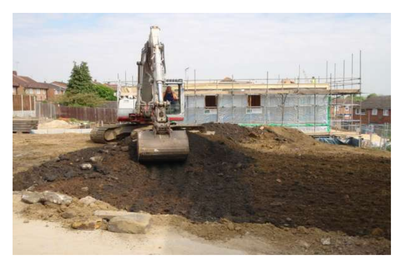
Plate 6. Site reduction in Site B