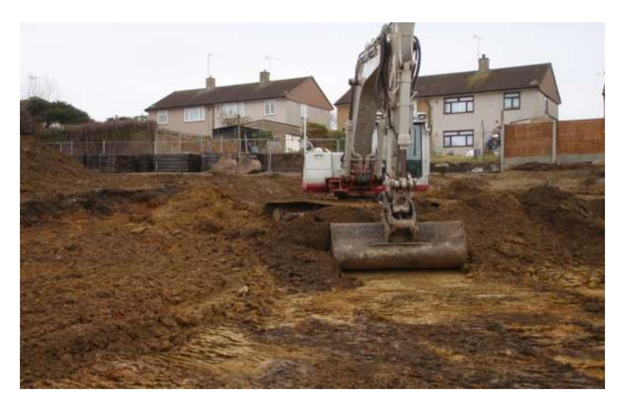
Plate 4. Site reduction in Site A